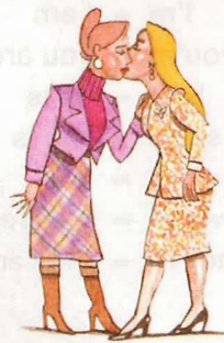
a kiss on the cheek