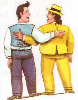
a pat on the back